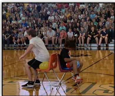
Students compete in a WEB Activity at the Welcome Assembly on the 7th grade first day of school.

Be on the lookout for more WEB events as the year progresses!