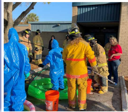
Practicing decontamination and HAZMAT with the Juniors and Firefighting students.