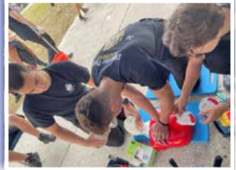
First Responders Disaster Day