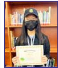
Elysia Hyun Electives