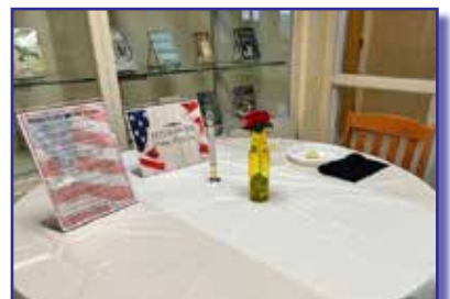
Veteran's Day Display