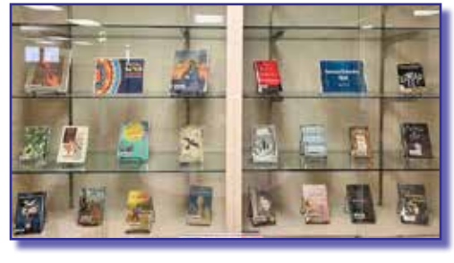
Book Displays highlighting Monthly Events and Celebration

Halloween craft one of our library lunchtime activities. Some students sewina their ghosts.