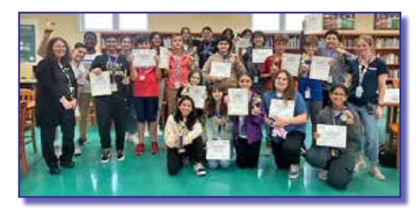
"Million Word Club" and "Halfway There" Club luncheon and Awards