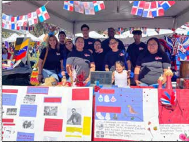
Fiesta de Pueblo, Greenacres FL