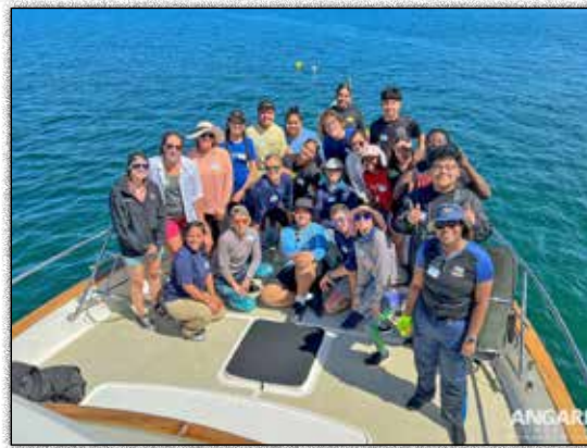
EXP 72: ANGARI crew, FIU scientists, students and teachers gather on R/V ANGARI's bow for a group photo.