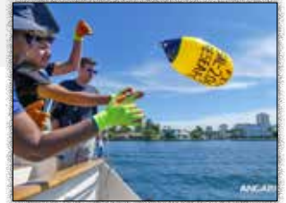
EXP 72: Drumline deployment is well underway in the Lake Worth Lagoon! A student throws a float clear of R/V ANGARI to complete a drumline set, and the wait begins...

This expedition was made possible with funding from the Great Charity Challenge.