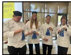
3rd Place Logo Design Winners