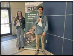
1st Place VEX Competition Winners

Dec. 21 ..... End of 2nd Grading Period Dec. 22 ..... Professional Day—No School Dec. 23—Jan. 7 ..... Winter Break Jan. 15 ..... Martin Luther King Day—No School Feb. 19 ..... Presidents Day—No School Mar. 7 ..... End of 3rd Grading Period Mar. 8 ..... Professional Day—No School Mar. 11—Mar. 15 ... Spring Break Mar. 29 ..... Mini Break May 24 ..... Last Day of School