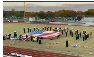
Straight Superiors for Mighty Sailor Band