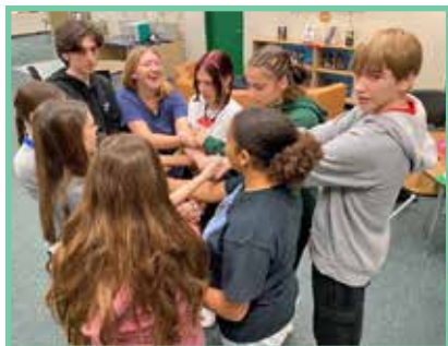
The Human Knot Game