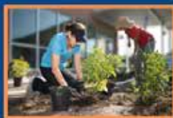
Office buildings work well for micro-habitats!