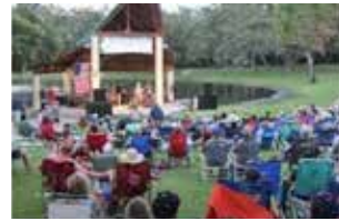
City of Seminole's Music in the Park