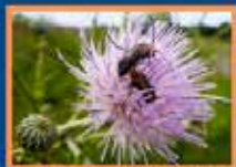
Beetles are pollinators, too!