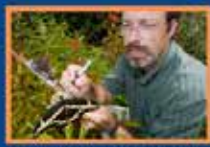
Be a citizen scientist!