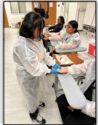
Medical Academy students practicing blood draws