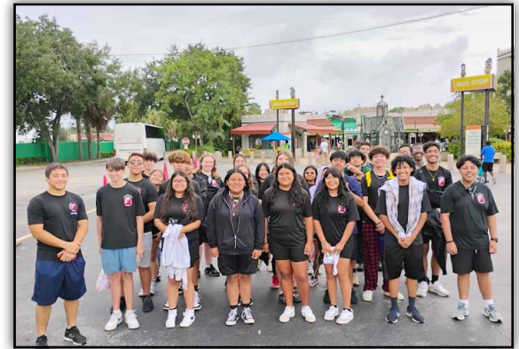
JROTC Cadets visit Busch Gardens

The Wolfpack Brigade CyberPatriot team won 179 points out of a possible 200! They place 4th in the state of Florida for all Army JROTC teams.