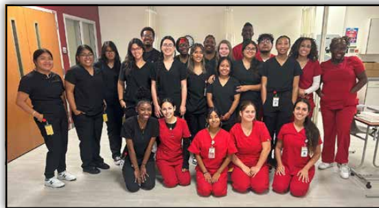
South Fort Myers Medical Assisting Students