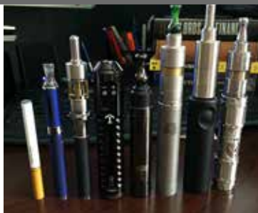
ASSORTMENT OF VARIOUS DEVICES