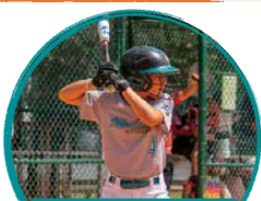
AFA Fall Travel & Babe Ruth Leagues