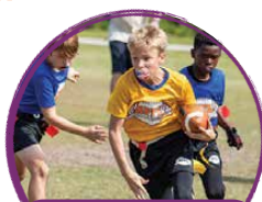
Flag Football & Cheerleading