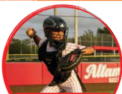
ABA Fall Travel & Babe Ruth Leagues