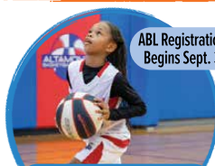
ABL Winter Basketball League