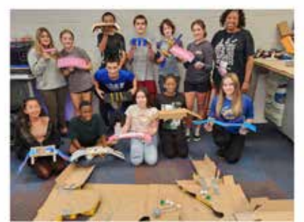
INNOVATION 3 BRIDGE DESIGNS