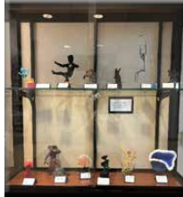
Modern Sculpture Display in Heritage Hall