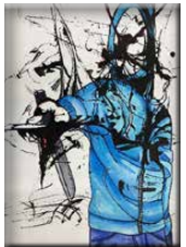
Scout Leed, grade 12