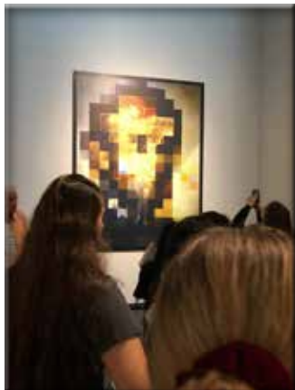
Students viewing Abe Lincoln Portrait.

Students in the Advanced Placement Studio Art class and the International Baccalaureate Visual Arts class were able to travel to St. Petersburg in October to explore the art of Salvador Dali. Students were also able to walk the Shine Mural (street art) work on their way to the Glassblowing demonstration at Morean Art Center.