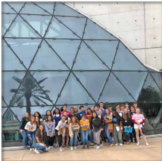
Students outside of the Dali Museum.