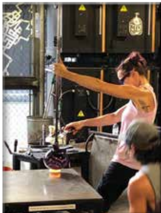
Glassblowing Demonstration at Morean Art Center